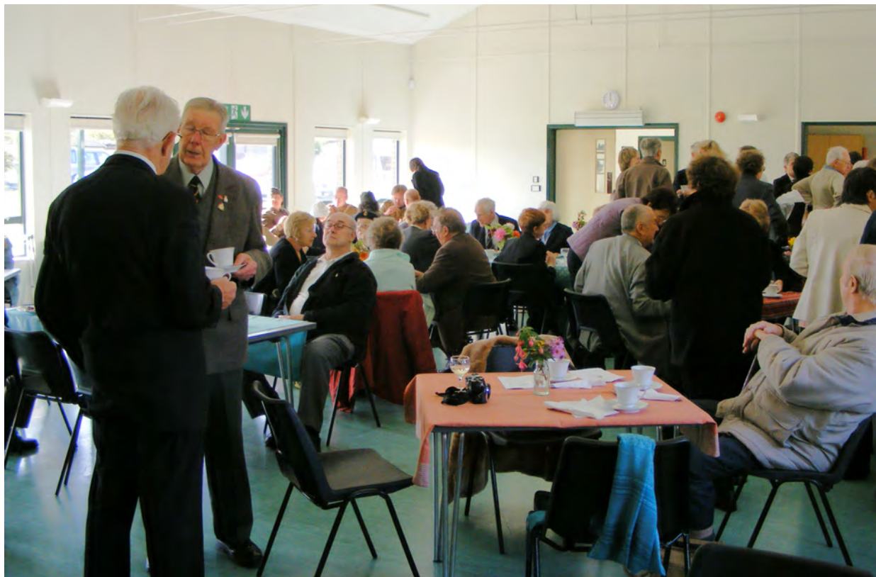
Feeding time at the trough!