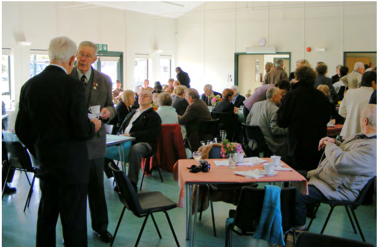
Feeding time at the trough!